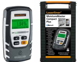
MoistureMaster Compact Plus inclusive carrying case + battery

Packing dimension (W x H x D) 155 x 265 x 81 mm