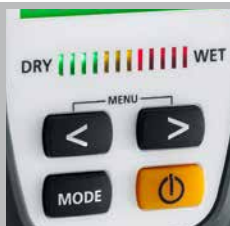
12 position wet/dry LED indicator