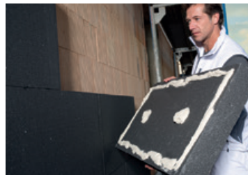
Adhesive and reinforcing mortar