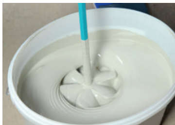
EP coating / paints