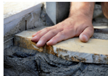
Natural stone mortar