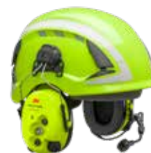
MT15H7P3EWS6 / MT15H7P3EWS6-111