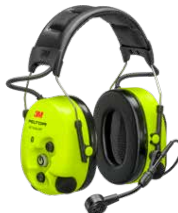
MT15H7AWS6 / MT15H7AWS6-111