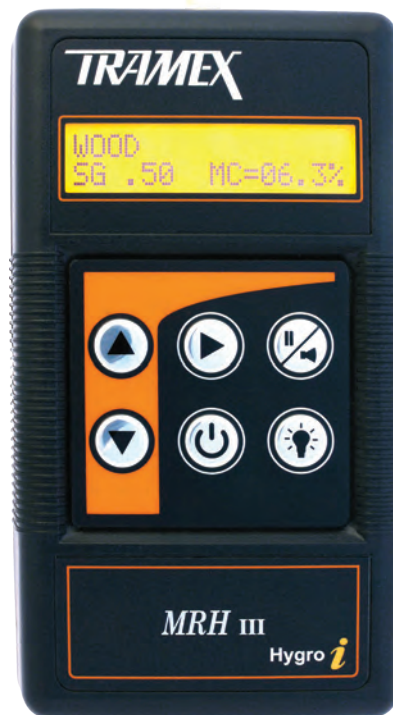
Product order code: MRH3