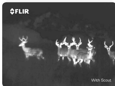
Scout PS-Series Camera Image