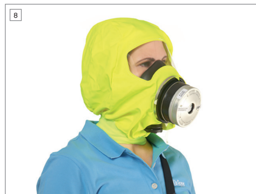
Check the fit of the half mask by closing the front filtering opening with the palm of your hand. If negative pressure is not generated readjust the half mask to ensure a close fit over nose and mouth.