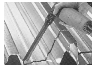
with Profile set 160