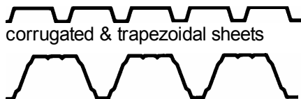
corrugated & trapezoidal sheets