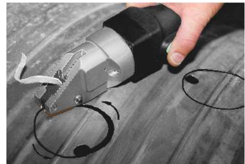
starting hole 12-14 mm Ø accurate cutting along a marked line