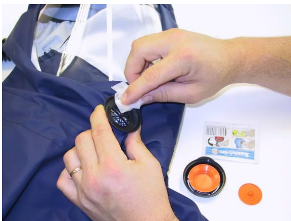
Clean the valve seat and check that the valve seat is ok.