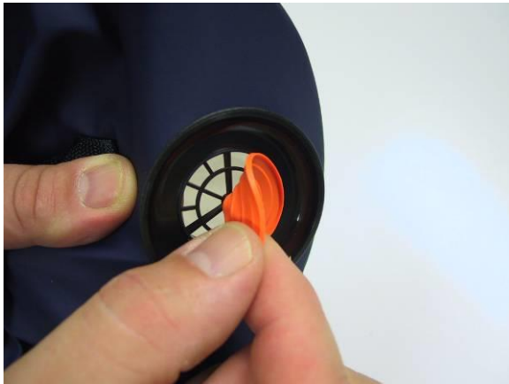
Slip of the membrane