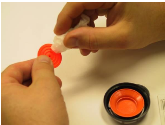
Clean the exhalation membrane